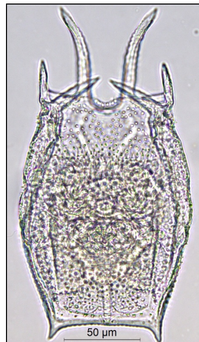
Figure 8. Keratella serrulata (Ehrenberg) (from Arunachal Pradesh, NEI)