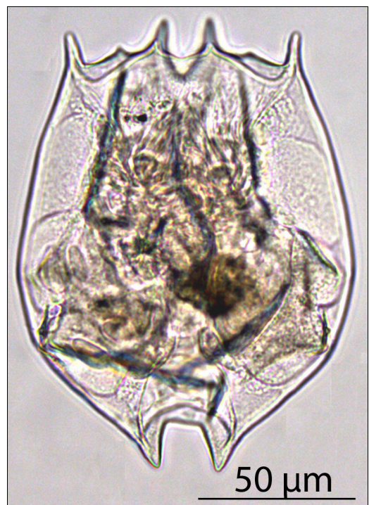
Figure 4. Brachionus kostei Shiel after Sharma (2014)