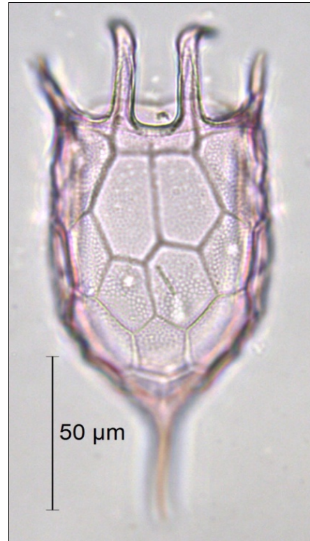
Figure 6. Keratella javana Hauer (from Mizoran state, NEI)