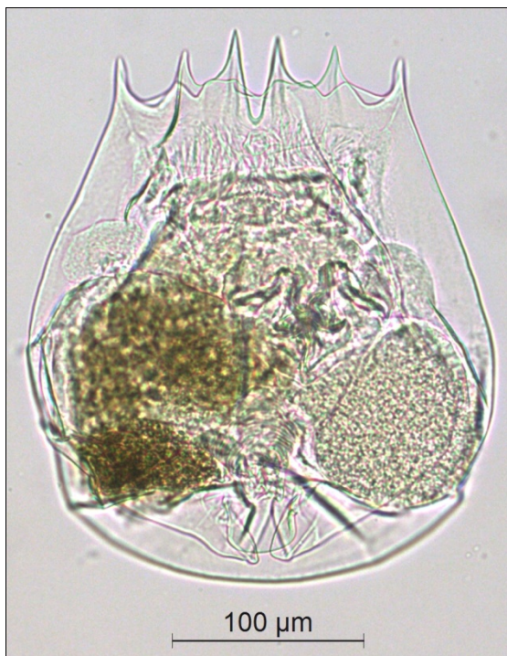
Figure 3. Brachionus durgae Dhanapathi (from Mizoram state, NEI)