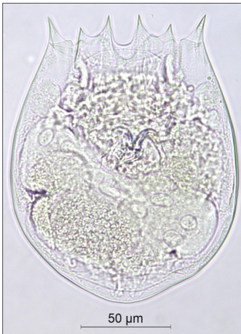
Figure 7. Notholca squamula (O.F. Müller) (from Arunachal Pradesh, NEI)