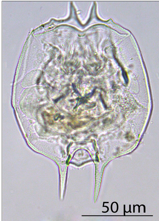
Figure 1. Brachionus dichotomus reductus Koste & Shiel, after Sharma (2014)