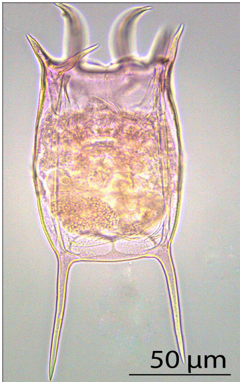
Figure 5. Keratella edmondsoni Ahlstrom , after Sharma (2014)