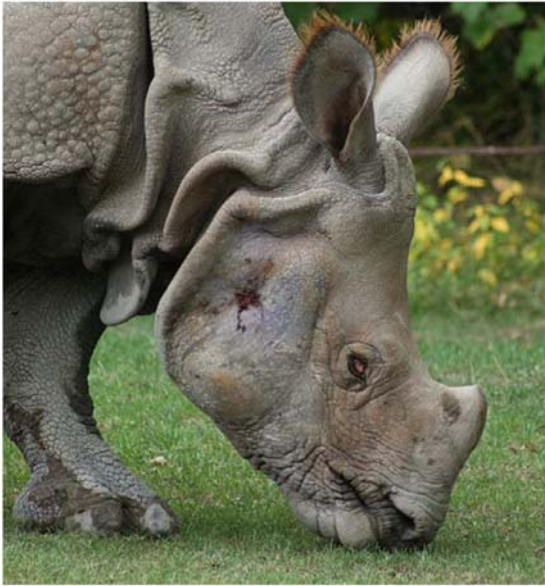
Fig. 2.: Indian rhinoceros

2. ábra: Indiai rinocérosz