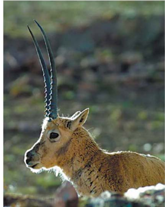
Fig. 3.: Chiru (detail, People's Daily)

Working from a basic description of the unicorn (a single horn, elephant-like feet, with massive strength and speed) the most obvious source animal is the Indian rhinoceros ( Rhinoceros unicornis Linnaeus, 1758; Fig. 2. ). In fact, this animal is the only known quadruped to bear a single horn (Perseus Online commentary on Pliny the Elder's NH 8.13). Shepard (1930, 28) believes that the Indian rhinoceros is the basis for Ctesias' wild ass due to the pharmaceutical powers attributed to its horn. While the belief that the rhinoceros horn has alexipharmic abilities is widespread, the fact that Ctesias specifies its placement on the forehead as opposed to the nose creates room for doubt (Suhr 1964, 102). Pliny later speaks of the rhinoceros in a separate section, which implies that he considered the two to be different (Pliny the Elder, NH, 8.29). Lavers (2009, 33) suggests that the unicorn reported by Aelian was similar to a rhinoceros in the description of the feet, tail, and strength. Aelian, however, stressed that the creature was definitely not a rhinoceros due to the fact that the rhinoceros's horn was located on its nose as opposed to its forehead, and because a description of a rhinoceros would have been easily identifiable to a Greek or Roman, due to their popularity in the Roman arena. The wild yak ( Bos mutus Przewalski, 1883) found on the Tibetan plateau may have inspired features of the unicorn.