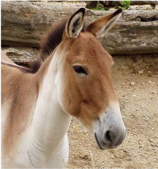
Fig. 4.: Kiang (Bodlina, detail, Wikimedia commons)