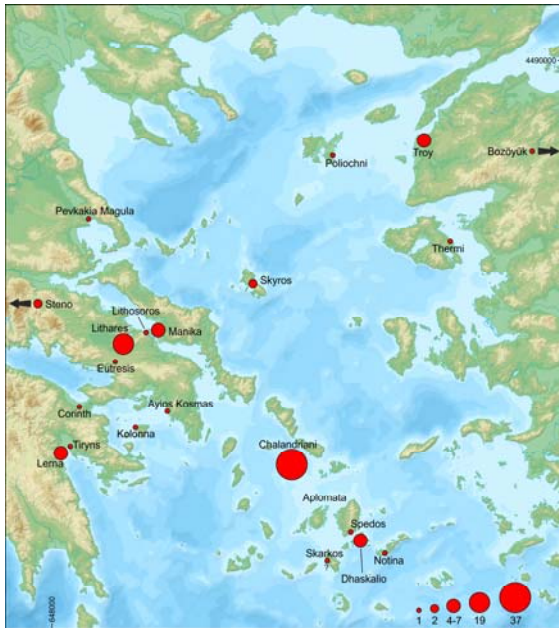
Fig. 2.: Regional distribution and abundance of the EBA bone tubes in the Aegean. Note their scarcity on the coast of western Turkey and the north Aegean as well as their complete lack on Crete. Background topography source: Wikipedia, map created by Eric Gaba; UTM, WGS84.

2. ábra: A korabronzkori csont csövecskék elterjedése az Égeikumban