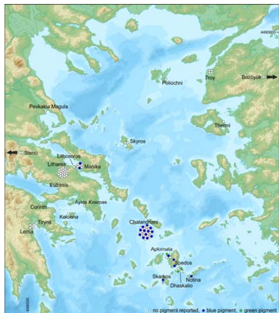
Fig. 6.: EBA bone tubes are commonly interpreted as containers for pigments. The regional distribution of bone tubes containing pigments shows, that so far all of them originate from the Aegean islands and none from the mainland. Additionally, all the tubes containing pigments have been found only in graves and none from settlements. Background topography source: Wikipedia, map created by Eric Gaba; UTM, WGS84.