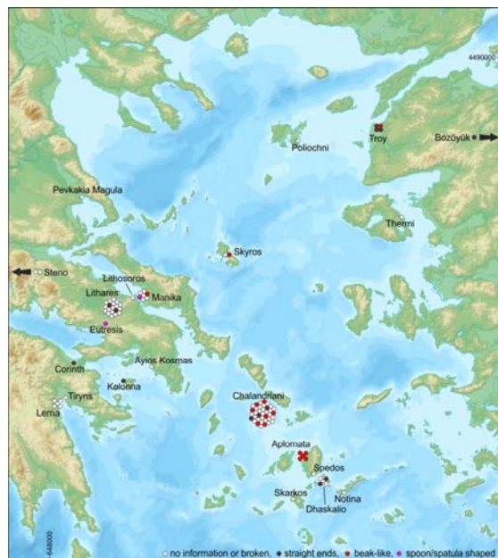
Fig. 7.: There are two main shapes for EBA bone tubes: Both ends cut straight at right angle or, one end cut straight, the other made like a beak. With the exception of one from Troy, all of the bone tubes with one beak-shaped end, originate from the islands. Background topography source: Wikipedia, map created by Eric Gaba; UTM, WGS84.