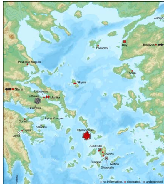
Fig. 5.: Many of the EBA bone tubes are decorated with engraved, geometrical patterns. The regional distribution shows that decorated tubes are dominating in the north Aegean and are very common in the Cyclades, but in contrast on the Greek mainland and especially in Boeotia undecorated tubes dominate. Background topography source: Wikipedia, map created by Eric Gaba; UTM, WGS84.