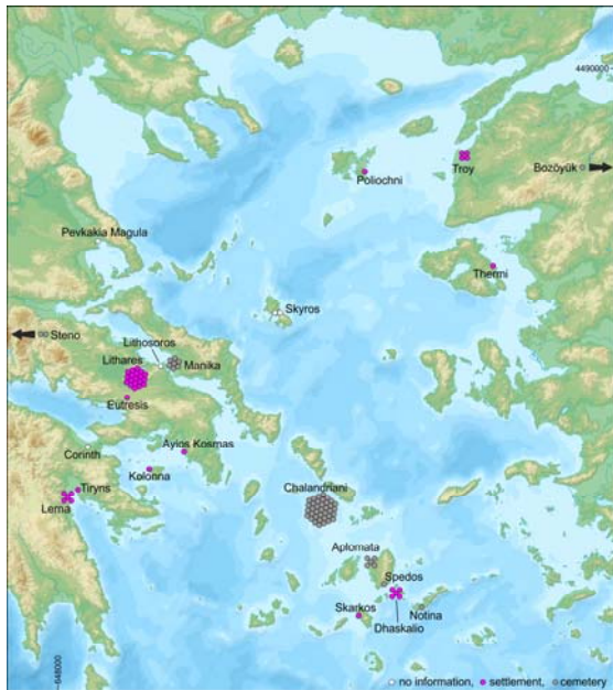
Fig. 4.: The archaeological context of the EBA bone tubes in the Aegean is very different between the islands and the mainland. Virtually all of the tubes from the islands have been found in graves, while almost all from the mainland originate from settlement contexts. Background topography source: Wikipedia, map created by Eric Gaba; UTM, WGS84.