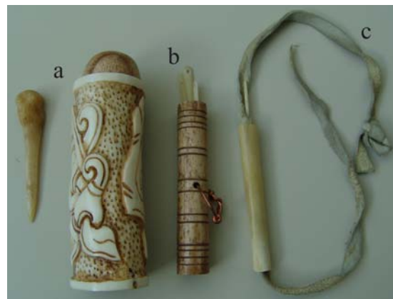
Fig. 8.: Examples of bone tubes from different periods and regions. All of them are related to the production of textiles. Bone tubes are from the collection of archaeo-textile scientist Karina Grömer (Natural History Museum, Vienna). (a) Viking Age Bone tube for needles. b) Bone tube containing bone needles from an Early Medieval cemetery. c) Inuit bone tube with a leather band through it containing a bone needle.

Although the ultimate use of bone tubes is connected to the “toiletory kit” (Branigan 1974: 31-34), only 21% contain traces of pigments ( Fig. 5., Table 1. ). Some observations show that bone tubes might have had more complex biographies. Caskey and Caskey (1960) write about the bone tube from Eutresis: “Another object of special interest is a bone tube, VIII.62, from the floor of House L. At one end it was worked into a flat tip, which shows wear from being rubbed. We do not know how it was used; probably in some simple, and perhaps obvious, step in spinning or preparing the threads or in weaving.